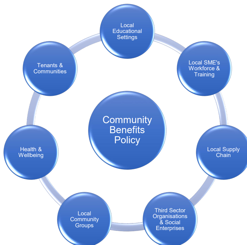
Figure 1 Targeted Groups